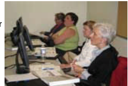
Participants listen intently as representatives from Milner library discuss ways to incorporate Primary Sources into teaching.